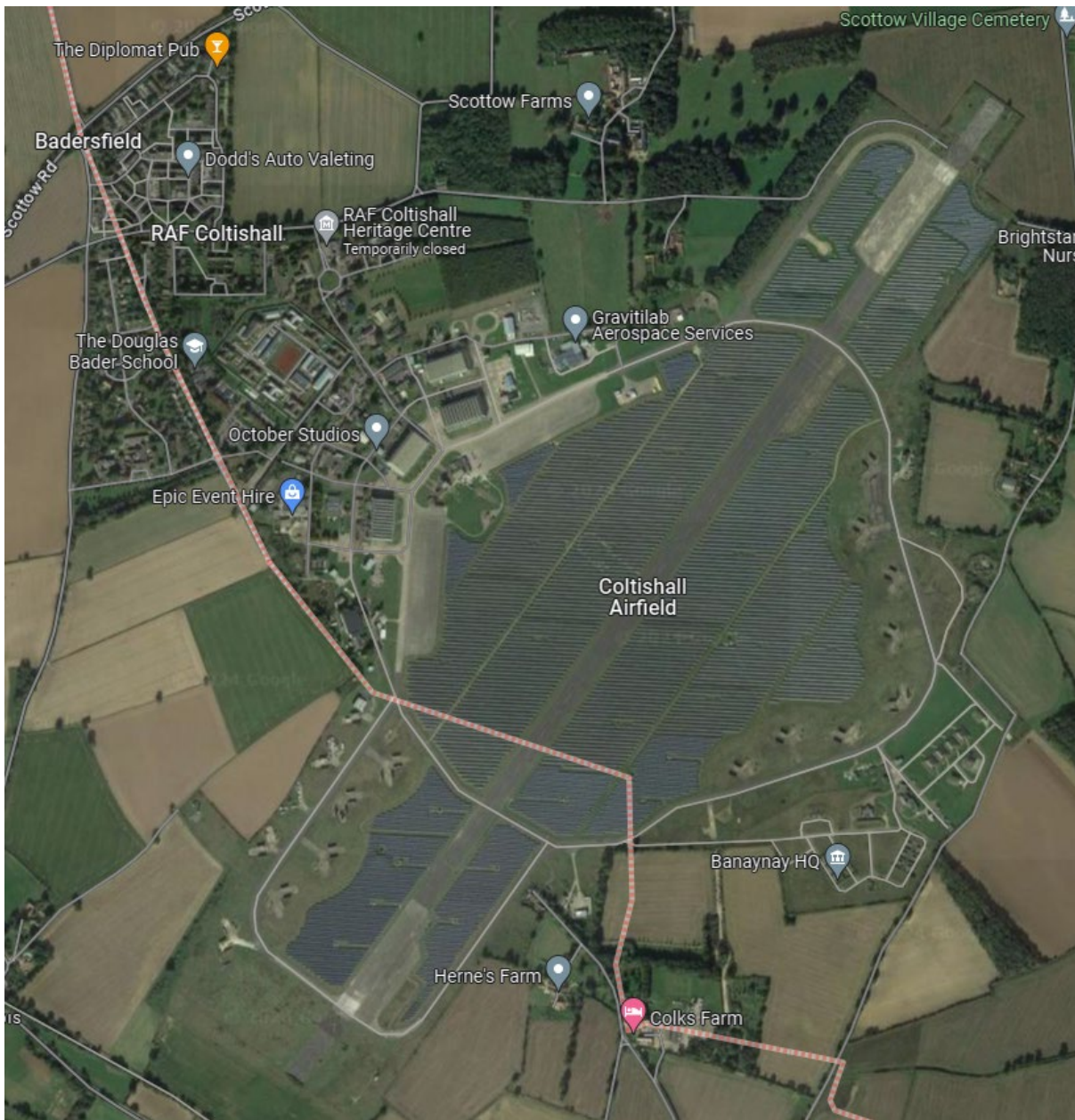
Map 3: Aerial View showing district boundary between North Norfolk (northeast) and Broadland (southwest) areas