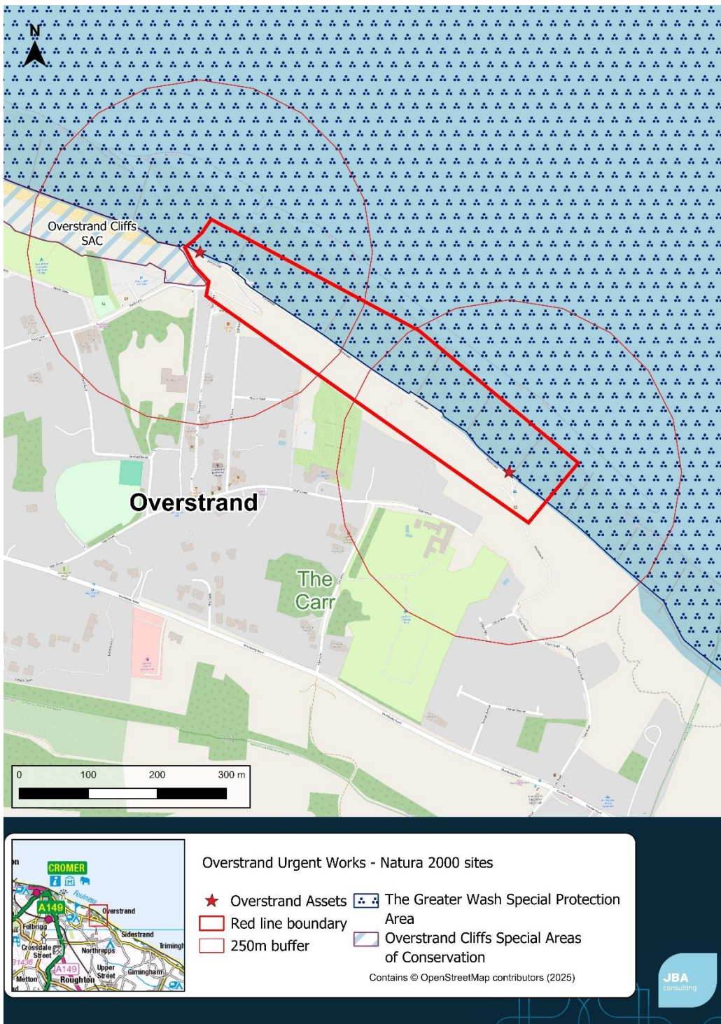
Figure 4-1: Location of works in relation to European designated sites.

The proposed works is located within the Greater Wash SPA and adjacent to but just outside of, the Overstrand Cliffs SAC, see Figure 4-1. At the closest point the works could be within 5m of the boundary, but will not take place inside the SAC.