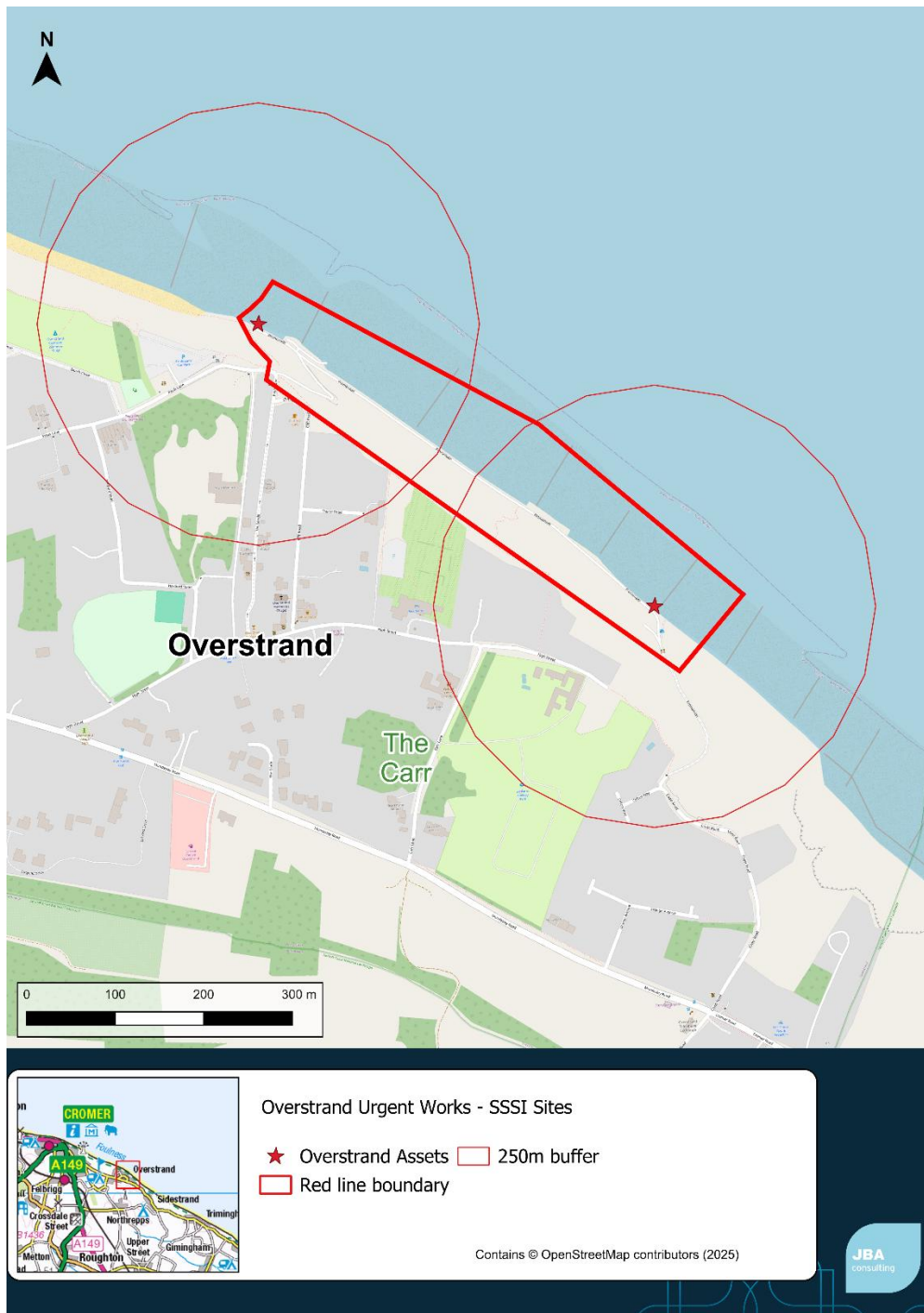
Figure 3-1: Site Location Map

The site is located on the coastline within the tidal environment approximately 3km south east of Cromer on the North Norfolk Coast. The approximate central Ordnance Survey grid reference (OSGR) is TG2497240970. Figure 3-1 below shows the location of the site in relation to the surrounding area.