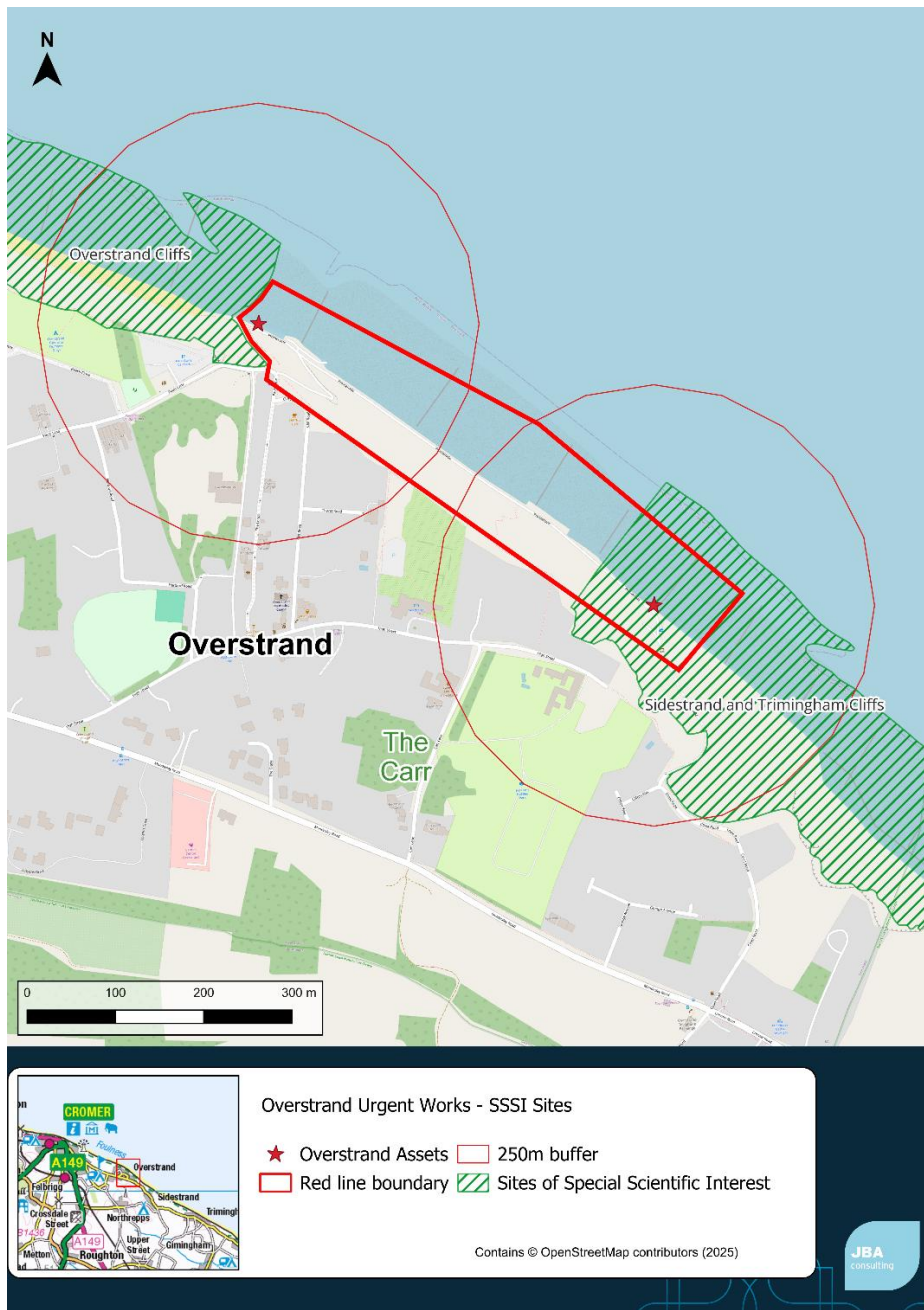
Figure 2-1 Location of SSSIs in relation to the proposed works boundary.

The proposed works are located adjacent to Overstrand Cliffs SSSI and within Sidestrand and Trimmingham Cliffs SSSI as shown in Figure 2-1 below. Due to the proximity of the site to these SSSIs, an assessment of the potential impacts of the proposed works is required. No other SSSIs are present within 2km of the proposed works.