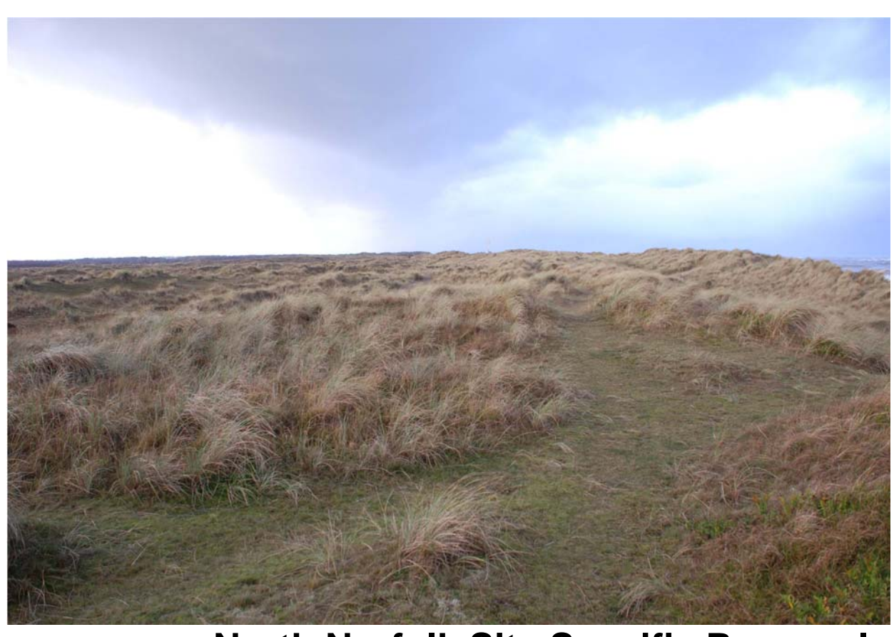
North Norfolk Site Specific Proposals Appropriate Assessment (Final Report)