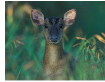
Female Muntjac deer