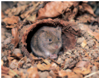
Bank vole at nest hole