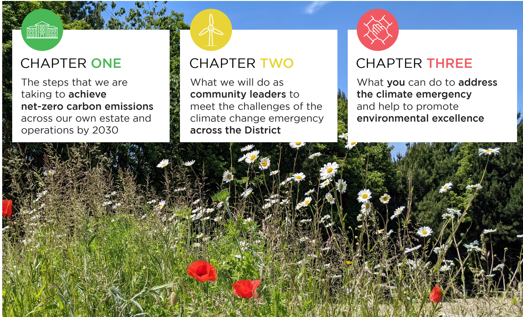
Wildflower and pollinator area at the front of North Norfolk District Council headquarters in Cromer, June 2021

What you can do to address the climate emergency and help to promote environmental excellence