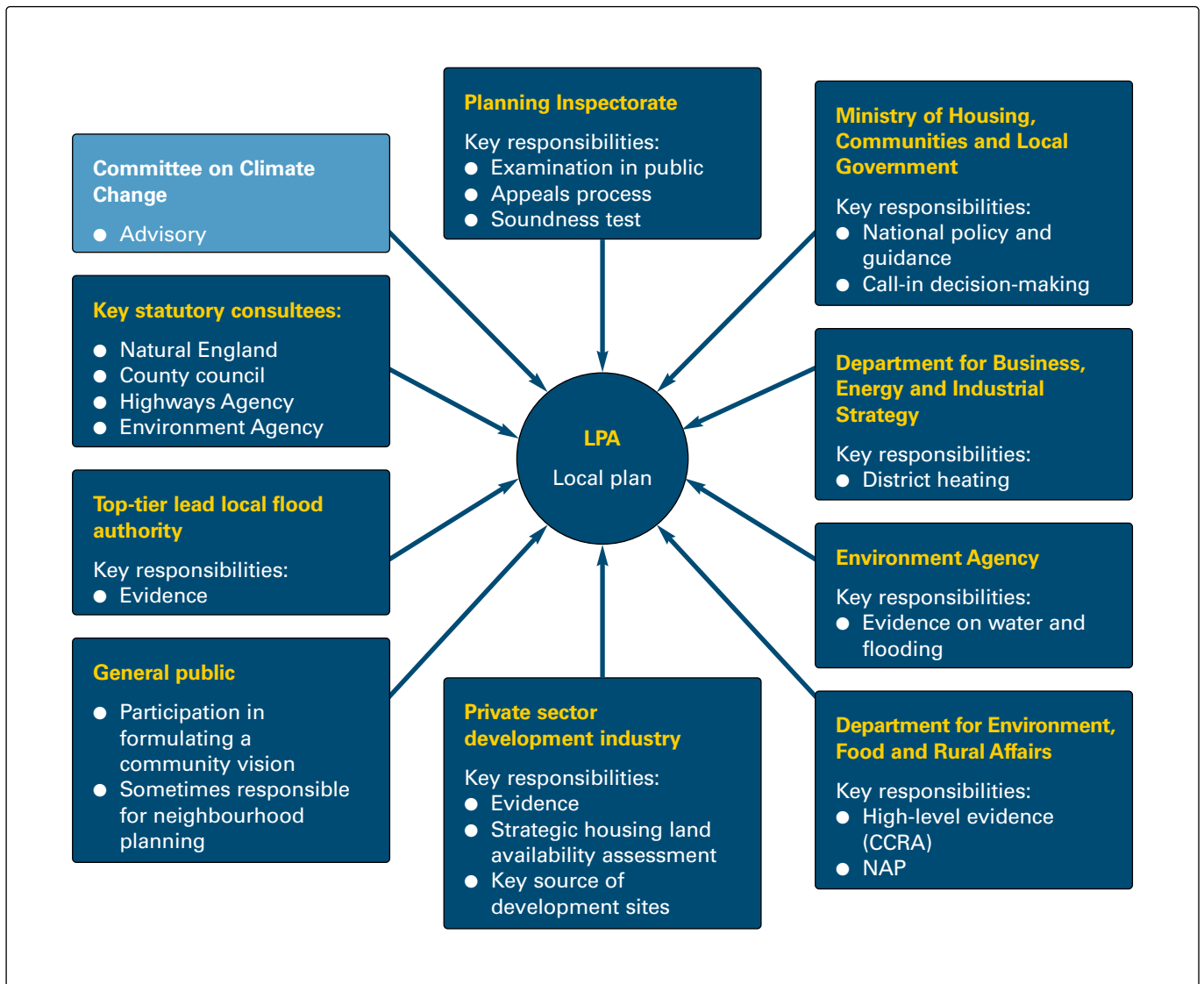
Institutions and bodies with a role in local planning for climate change