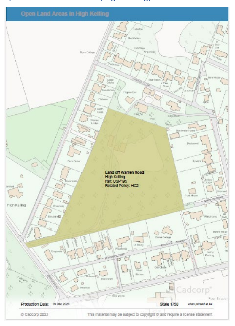
10.4.12 The land's undeveloped nature forms part of the wider settlement character.